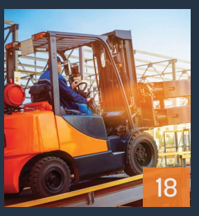
THINK TWICE BEFORE ATTACKING PLAINTIFFS' CREDIBILITY