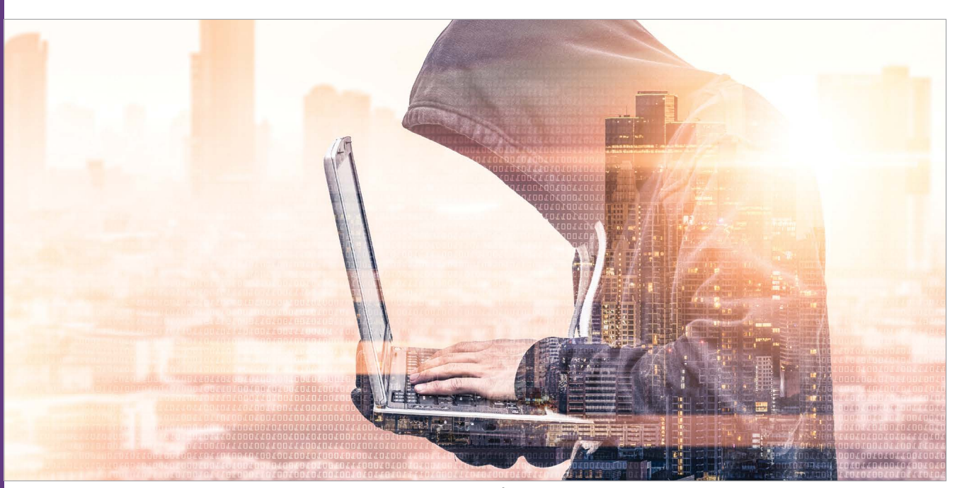
Image: The double exposure image of the hacker using a laptop.

Until then, if stolen privileged communications have entered the public domain, legal professional privilege will not get the cat back in the bag.