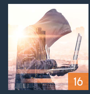
NO LUCK IN PUTTING THE PRIVILEGED CAT BACK IN THE BAG