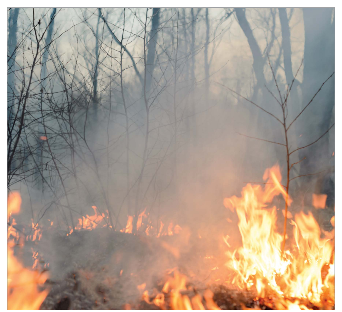
Image: Bush fire, burning grass and small trees, photo by Dmitry Sedakov.

The Government is, as always, an insurer of last resort. As mentioned in the July 2019 GILC Risk Radar, France and Norway are both exploring the best methods of managing catastrophe cover; with Norway introducing a Natural Perils Pool with parallels to the Australian Terrorism Reinsurance Scheme. But even if the introduction of a Reinsurance Scheme aids to partially relieve the burden on first party insurers, class actions are here to stay and the risk profile of third party insurers will continue to develop on that basis.