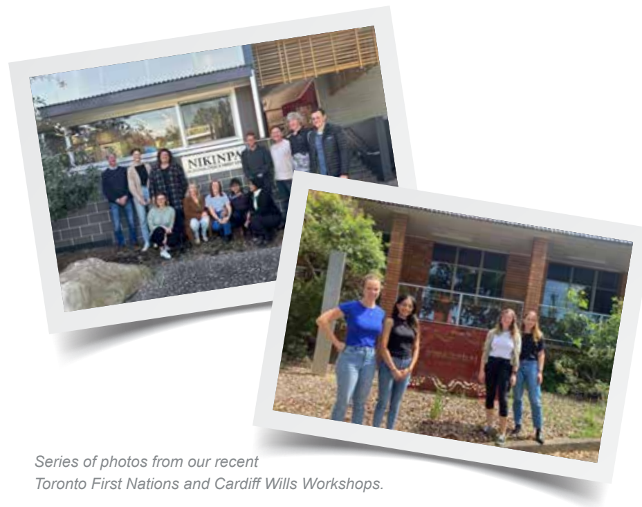
Series of photos from our recent Toronto First Nations and Cardiff Wills Workshops.

Internally, we acknowledge and celebrate NAIDOC and National Reconciliation Week annually through our culture and identity employee network and internal communications teams and are committed to engaging our people on our work to address the social and economic inequalities experienced by Aboriginal and Torres Strait Islander communities.